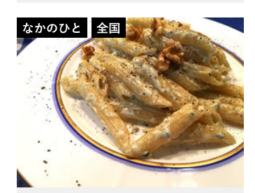
なかのひとからご挨拶 ~Moto's キ

鍋とフライパンさえあれば、まな板いらずでパパでも作れる簡単時短料理をご紹介!子どもの 日にもぜひ。